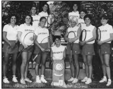
The 1984 Division III National Championship team and the 1985 DIII national championship runner-up team (below)